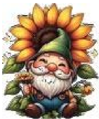
May the sun shine bright and keep you safe and healthy. God Bless!